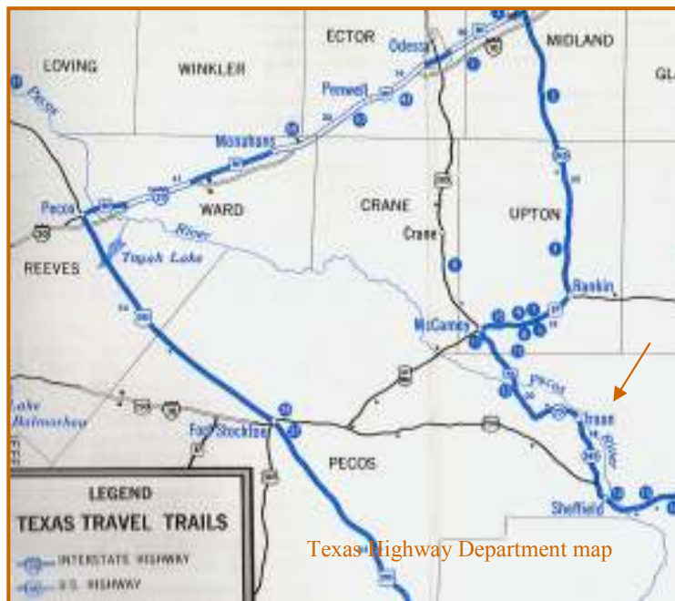
Texas Highway Department map