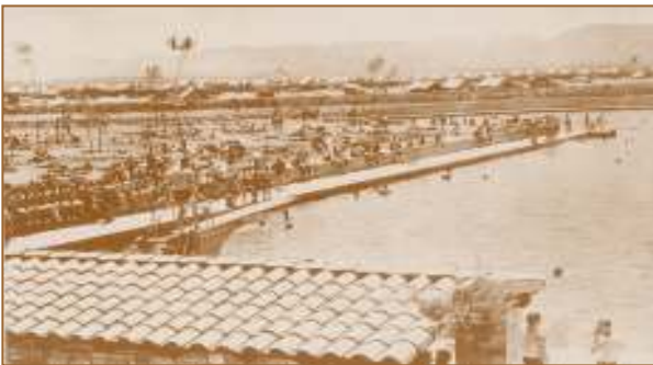
Image of pool and CCC facts taken from Texas Parks and Wildlife, The Civilian Conservation Corps in Texas State Parks (1986).

These state parks—once tributes to the perseverance of young men in hard economic times—have fallen on hard times of their own. They are in desperate need of structural repairs. Contact your state representative, telling him or her the parks are important to our history and enjoyment. They must be maintained properly by the State of Texas. — Editor